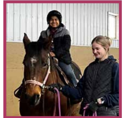
We ended 2022 with a fun day at Willow Pond Stables – what a great way to end one year and prepare to gallop into a new one!