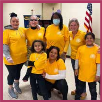
Wearing o' the Mustard at a Saginaw Knights of Columbus 4232 fish fry in March.