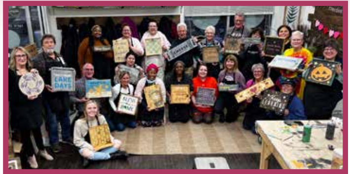
In January, we had a great time at our first volunteer appreciation gathering at Board & Brush!