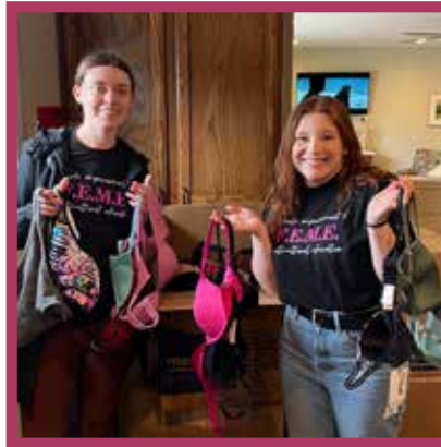
BRA-vo to F.E.M.E. at SVSU for donating over 400 bras from their annual collection!