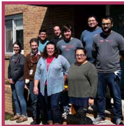
Members of Dow's Hispanic Latin Network did some awesome spring cleaning inside and out – Mustard transformation!