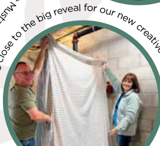
Getting close to the big reveal for our new creative outlet space!