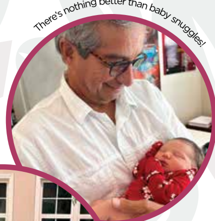
There's nothing better than baby snuggles!