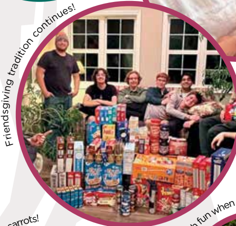
Friendsgiving tradition continues!